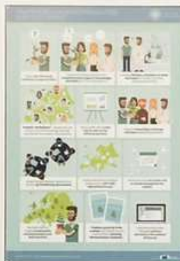
Figure 2. EIP-AGRI (2017). Horizon 2020 multi-actor projects.

The Multi-Actor Approach is a mechanism adopted by the European Commission's strategy for EU agricultural research and innovation 1 . The aim is to 'boost demand-driven innovation and the implementation of research, creating synergies between EU policies', and increase impacts through process of genuine co-creation of knowledge.