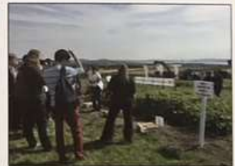
Figure 3. Translation of research into practice: Potatoes in Practice, James Hutton Institute, Dundee, UK, August 2015.

The Multi-Actor Platforms (MAPs) will enable ongoing involvement and two-way exchange of ideas for co-learning and co-creation of knowledge with actors at European and local levels 3 . MAPs are a core part of the transdisciplinary approach of UNISECO.