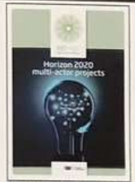
Figure 1. European Commission Guide to Horizon 2020 multi-actor projects.