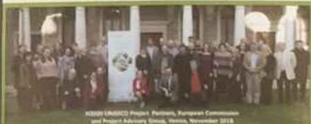
UNISECO Project Forum, European Commission and Project Advisory Group, Vienna, November 2018